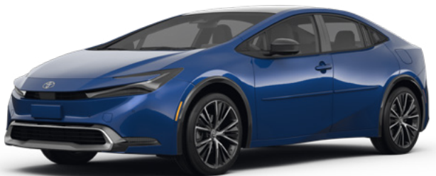
WE62046 - WHEEL HUB ASSEMBLY 108,167 VEHICLES IN OPERATION