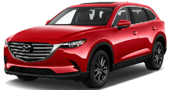
WE62068 - WHEEL HUB ASSEMBLY 195,731 VEHICLES IN OPERATION