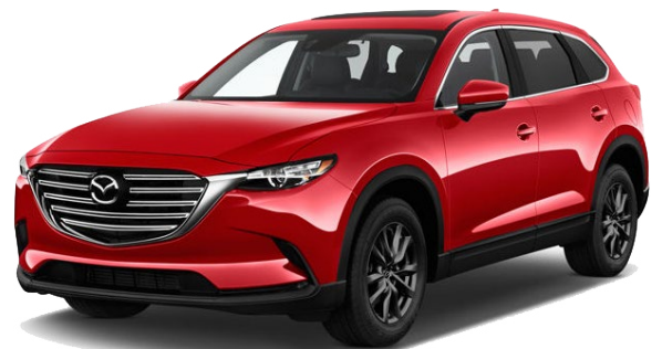
2016 - 2021 MAZDA CX-9 (FWD)