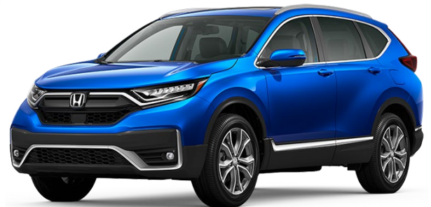
2017 - 2022 HONDA CR-V (FWD)