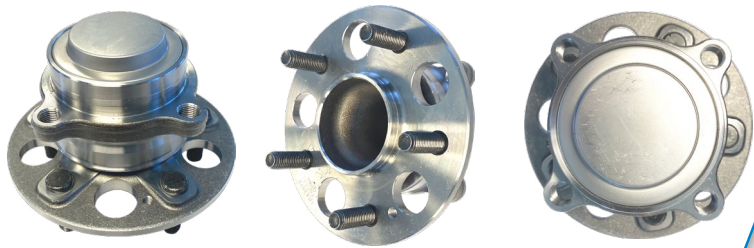
WE62013 - WHEEL HUB ASSEMBLY 624,044 VEHICLES IN OPERATION