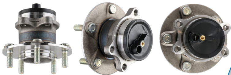
WE61878 - WHEEL HUB ASSEMBLY 51,197 VEHICLES IN OPERATION